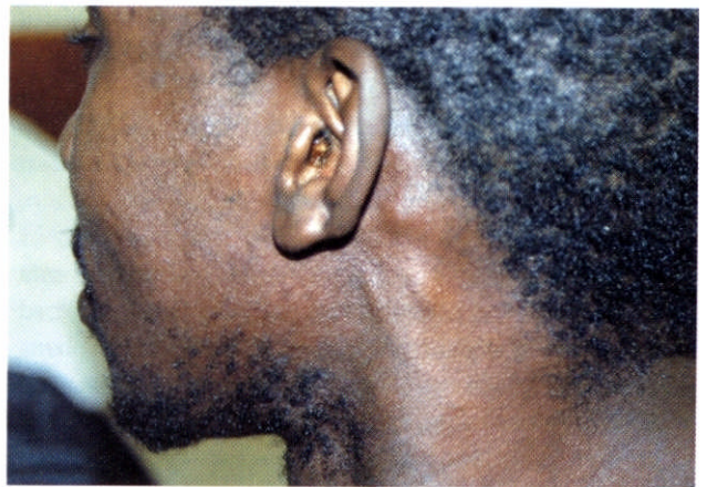
Figure 3. Enlarged cervical nerves. Figura 3. Espessamento de nervo cervical.