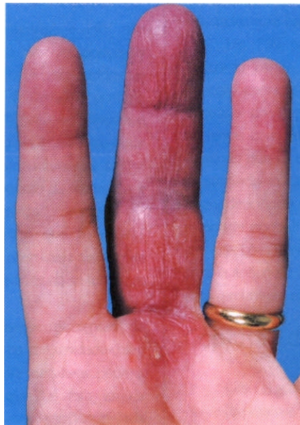
Figure 4. Erythematous infiltrated middle finger. Figura 4. Dedo médio infiltrado e eritematoso.