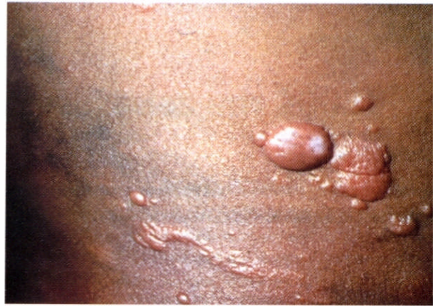
Figure 1 B. Histoid leprosy. Figura 1B. Hanseníase históide.