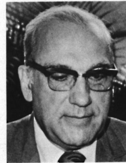
DR. JACINTO CONVIT 1968-1978