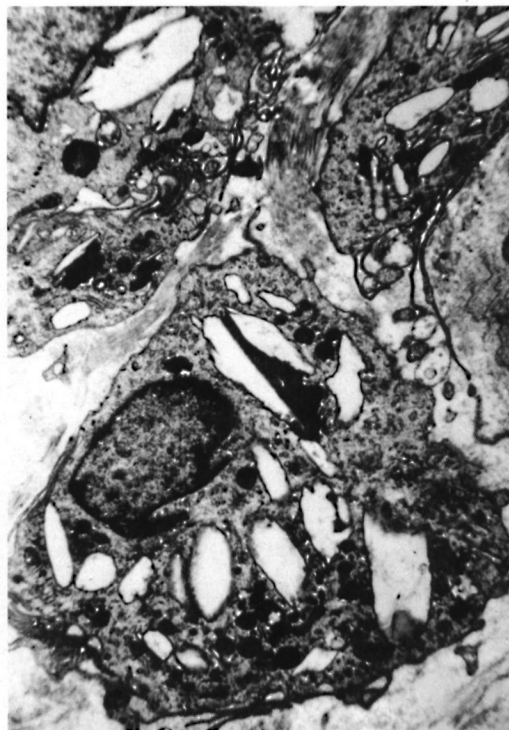
FIG. 2. Ultrastructural presence of numerous crystals in macrophage cytoplasm ( \times 20,000 ).

viously been observed in patients developing an enteropathy due to clofazimine. Secondly, the patient improved on a gluten-free diet, and despite the jejunal biopsy this might represent a gluten enteropathy aggravated by the clofazimine intake.