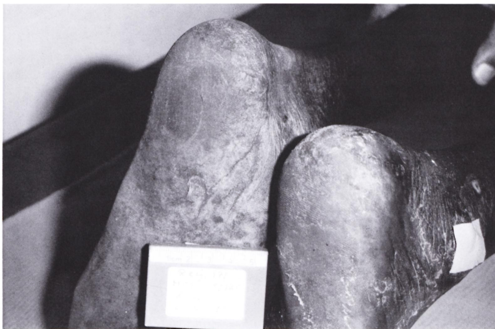
FIG. 3. Multiple cracks on both feet. One foot was treated with zinc oxide tape and made perfectly smooth, soft, and clean in a couple of weeks.

and soft and have little tendency to shrink. In animal experiments, this was attributed to the fact that the collagen fibrils were especially thin and had a very regular course (9) . The hydration caused by the tape is a contributing factor to the softness and pliability. It is good practice, therefore, to keep plantar scars continuously covered by a piece of tape, particularly in areas with marked strain, for instance, in the flexion crease of the big toe. (In this study a Swedish adhesive tape was employed but any other good zinc oxide tape may be equally useful.)