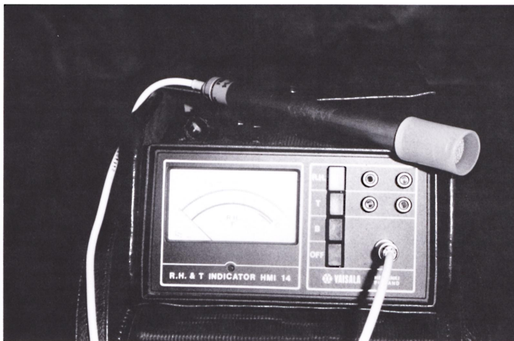
FIG. 1. The indicator and probe of the Vaisala Humicap humidity meter. Probe is equipped with a cylindrical plastic hood.