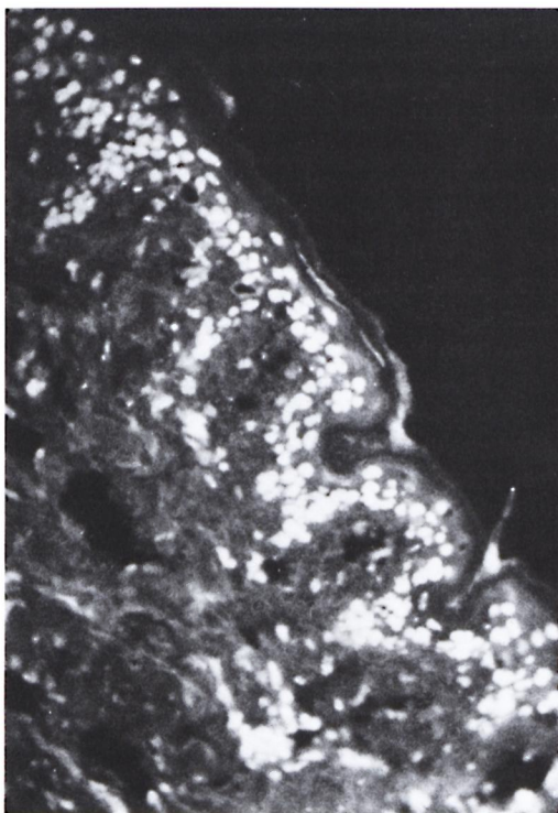
FIG. 1. Indirect immunofluorescence reaction in a skin biopsy section. ANA, IgG type, homogeneous pattern against the nuclei of the epidermis can be observed (original magnification \times 100 ).