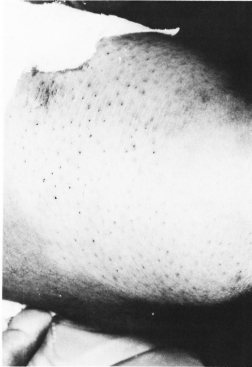
FIG. 1. Borderline tuberculoid lesion showing comedones.