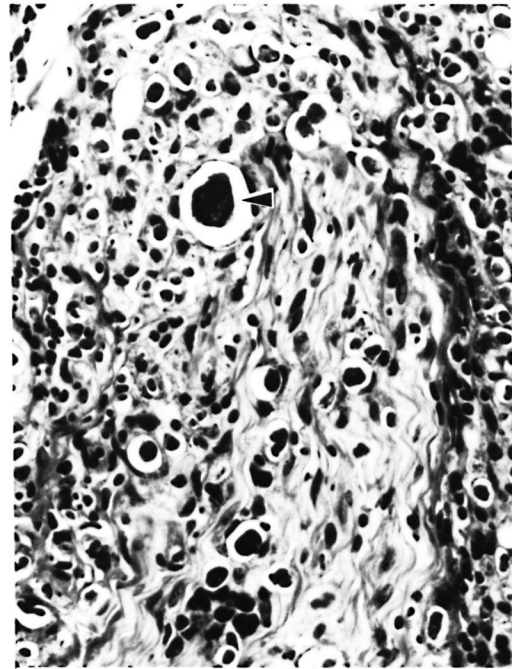
FIG. 1. Section of skin and dermal nerve from rhesus monkey 8664, showing lymphohistiocytic infiltrate and numerous large globi (◄) (H&E \times 250 ).

At necropsy, there were nodular enlargements of the margins of both ears, and the skin around the nose and upper lip was scaly and nodular. There was a focal ulcerated nodule 1 cm in diameter on the scrotum. Lesions not due to M. leprae consisted of leukemic infiltrates in numerous organs, chronic meningitis, chronic myocarditis,