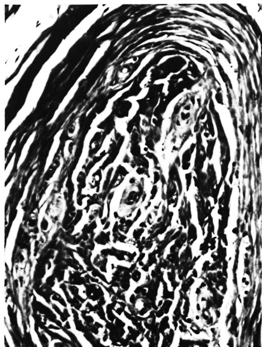
FIG. 4. Dermal nerve from rhesus monkey A491 52 months after SIV infection. Note onion-skin appearance of perineurium and intraneural fibrosis (Masson \times 250 ).

All lymph nodes had severe follicular atrophy and were depleted of lymphocytes. Peripheral nodes often had heavy histio-