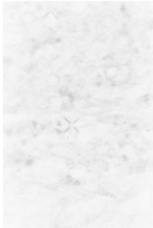
FIG. 3. Special Ziehl-Neelsen staining showing clusters of leprosy bacilli.

Se presenta el caso de un obrero de origen mexicano, de 42 años de edad, con una historia previa de neurofibromatosis, que presentó una nariz congestionada y ulceración crónica del paladar blando. En su piel se encontraron múltiples nódulos subcutáneos y los exámenes de laboratorio revelaron un elevado tiempo parcial de tromboplastina activada (TPTA) y la presencia de un anticoagulante circulante parecido al encontrado en lupus y de clase IgM, según los estudios cuantitativos de inmunoglobulinas. Aunque los defectos de