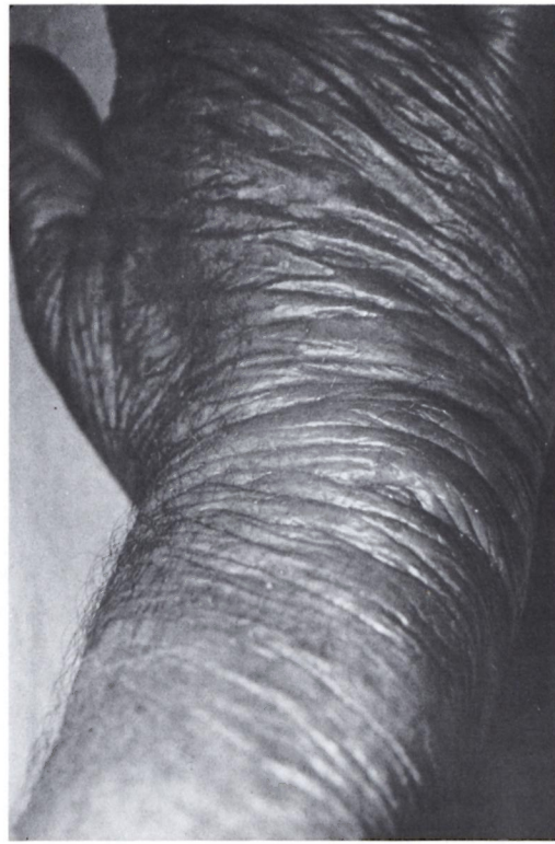
FIG. 2. The strip on distal forearm and dorsum of the wrist and hand showing atrophy and scarring.