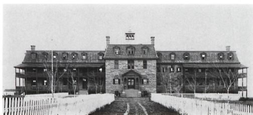
FIG. 4. The Tracadie Lazaretto, c. 1900. The left wing housed the Sisters’ convent and the right wing with its partial verandahs served as wards for the leprosy patients (the males on the first storey, the females segregated on the second). Behind the white picket fence to the right was the patients’ garden where they could grow flowers and vegetables. Dr. Smith’s office was to the left of the main entrance and the pharmacy to the right. Extending to the rear was a hospital wing.

With this promotion, Dr. Smith obtained the security and affirmation he had always craved. His daily workplace was the newly constructed Tracadie lazaretto (Fig. 4), a massive three-storey stone structure with an imposing cruciform shape, mansard roof and verandas. A far cry from its rustic predecessor, the new structure, completed in 1896,