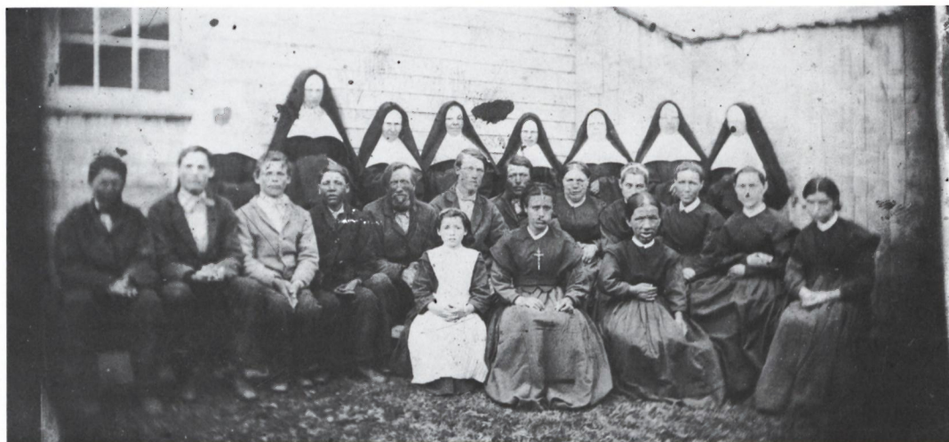
FIG. 5. The Religious Hospitallers of Saint Joseph Sisters and their patients at the Tracadie Lazaretto, c. 1875.