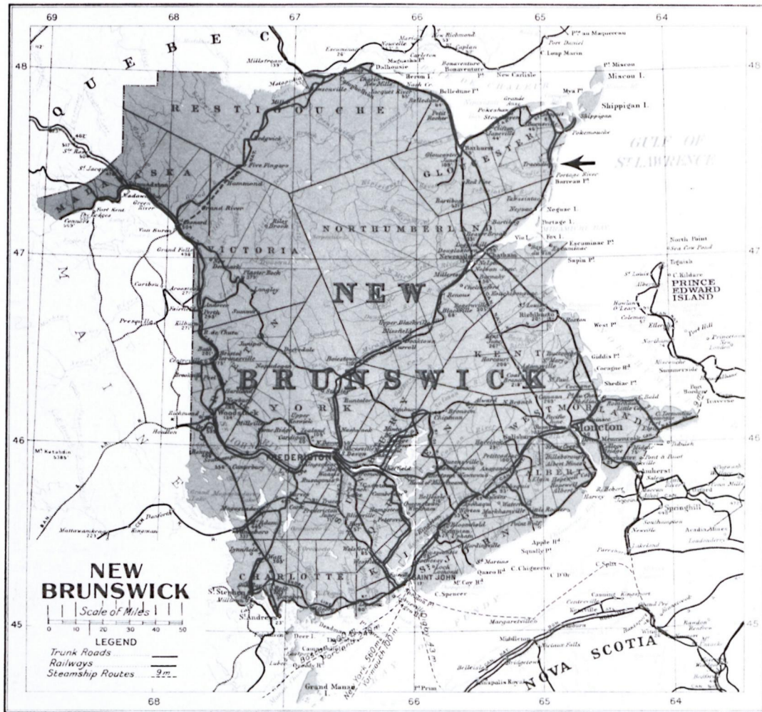
FIG. 1. Map of the Province of New Brunswick, Canada, c. 1915. This map shows the coastal village of Tracadie (←) in Gloucester County facing the Gulf of St. Lawrence (Provincial Archives of New Brunswick, 203 c. 1915).