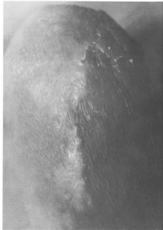
FIG. 1. Anesthetic plaque on preputial skin.

A 45-year-old male presented to us with 2 month's history of paresthesia involving the distal part of both extremities. Clinical examination revealed loss of pain, touch and temperature sensation over the dorsum of both hands and feet. Examination of the peripheral nerves showed bilaterally thickened ulnar nerves and thickened and tender right common peroneal nerve. The patient when examined for any cutaneous lesion showed one erythematous hypoesthetic plaque on the skin of the lower back. Interestingly, the skin of the prepuce also had a well-defined, shiny, erythematous plaque (Fig. 1). The lesion was extending onto the mucosal surface of the prepuce. The plaque was completely anesthetic to pinprick, touch and temperature. Cutaneous and neurological findings taken together suggested a clinical diagnosis of borderline tuberculoid Hansen's disease. A slit-skin smear was negative for acid-fast bacilli. A skin biopsy from the lesion on the prepuce showed epidermal atrophy and the presence of an epithelioid cell granuloma in the dermis with many giant cells. The histologic features were consistent with tuberculoid Hansen's disease (Fig. 2).